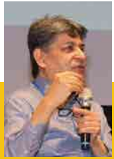
Mr. Geet Sethi Co-Founder, Olympic Gold Quest, World Champion- Billiards, Ahmedabad.